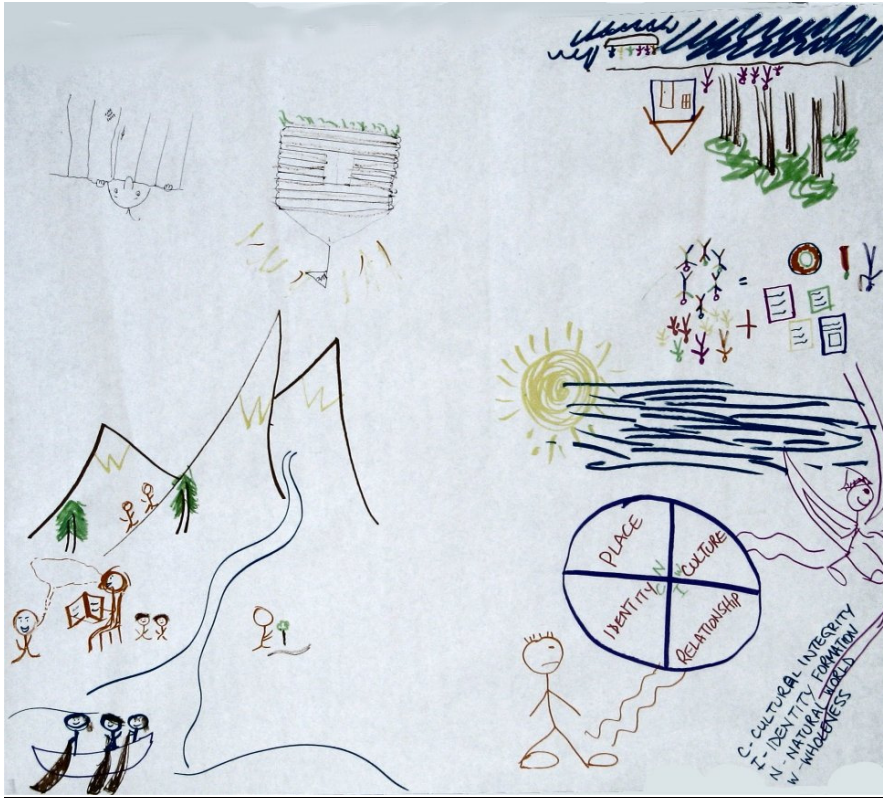
Image shows student going over the fence – asking “what can I get at the college?”